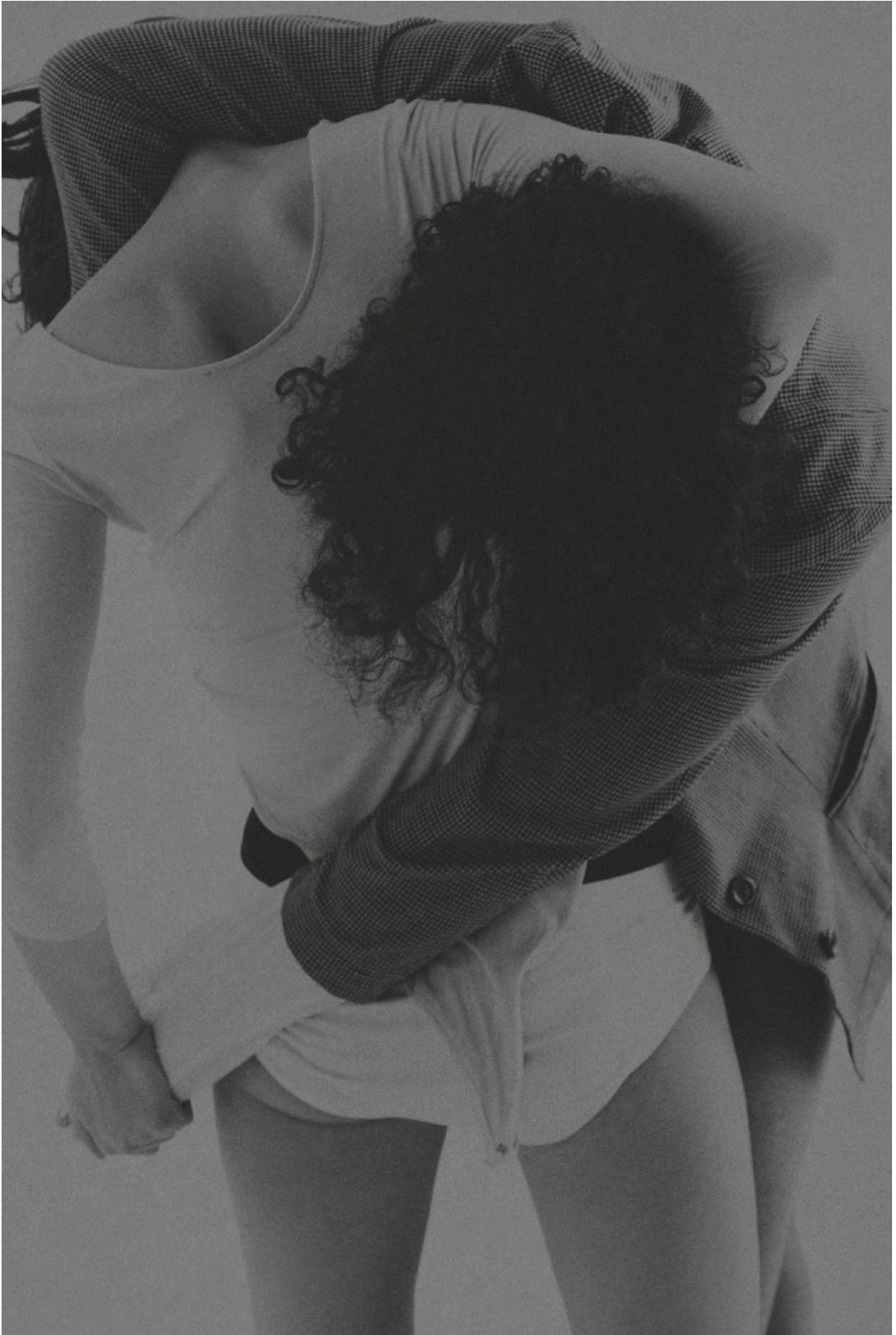
© Pascale Arnaud. Laureate of the Prix Picto de la Mode 2017