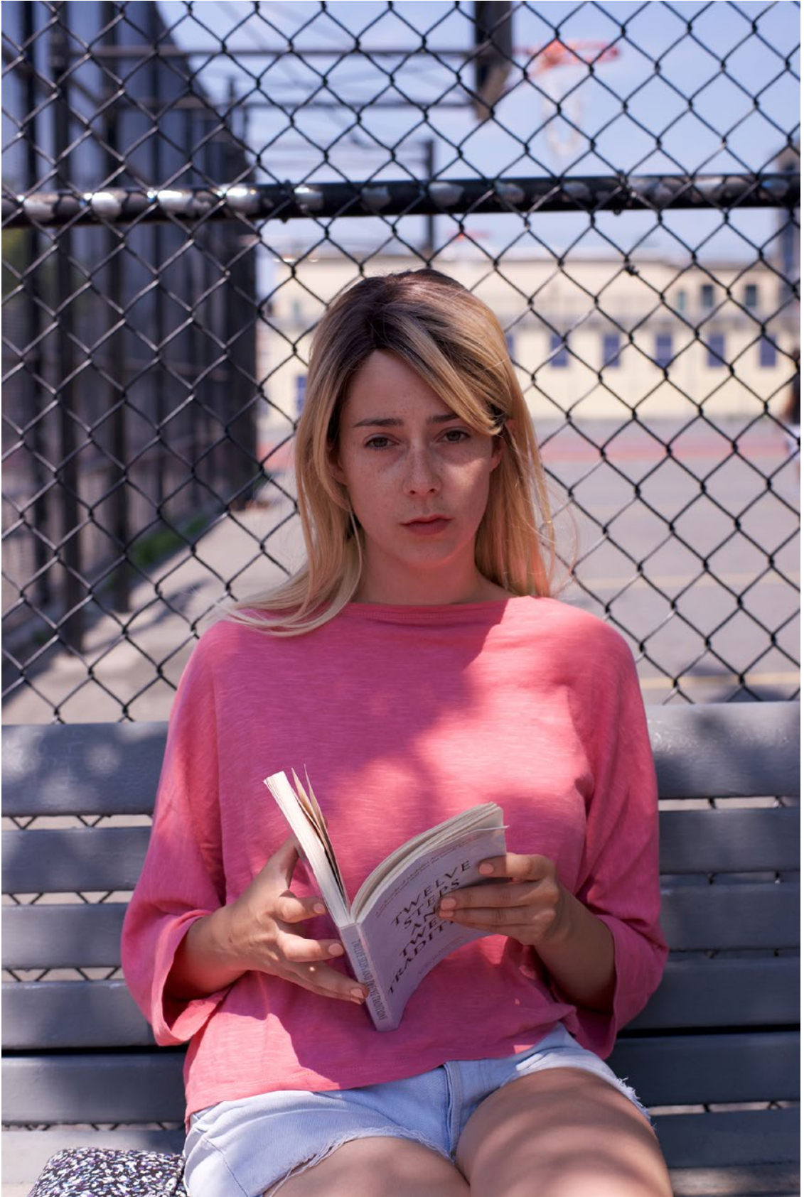
2 nd prize of the Prix Picto de la Mode 2017