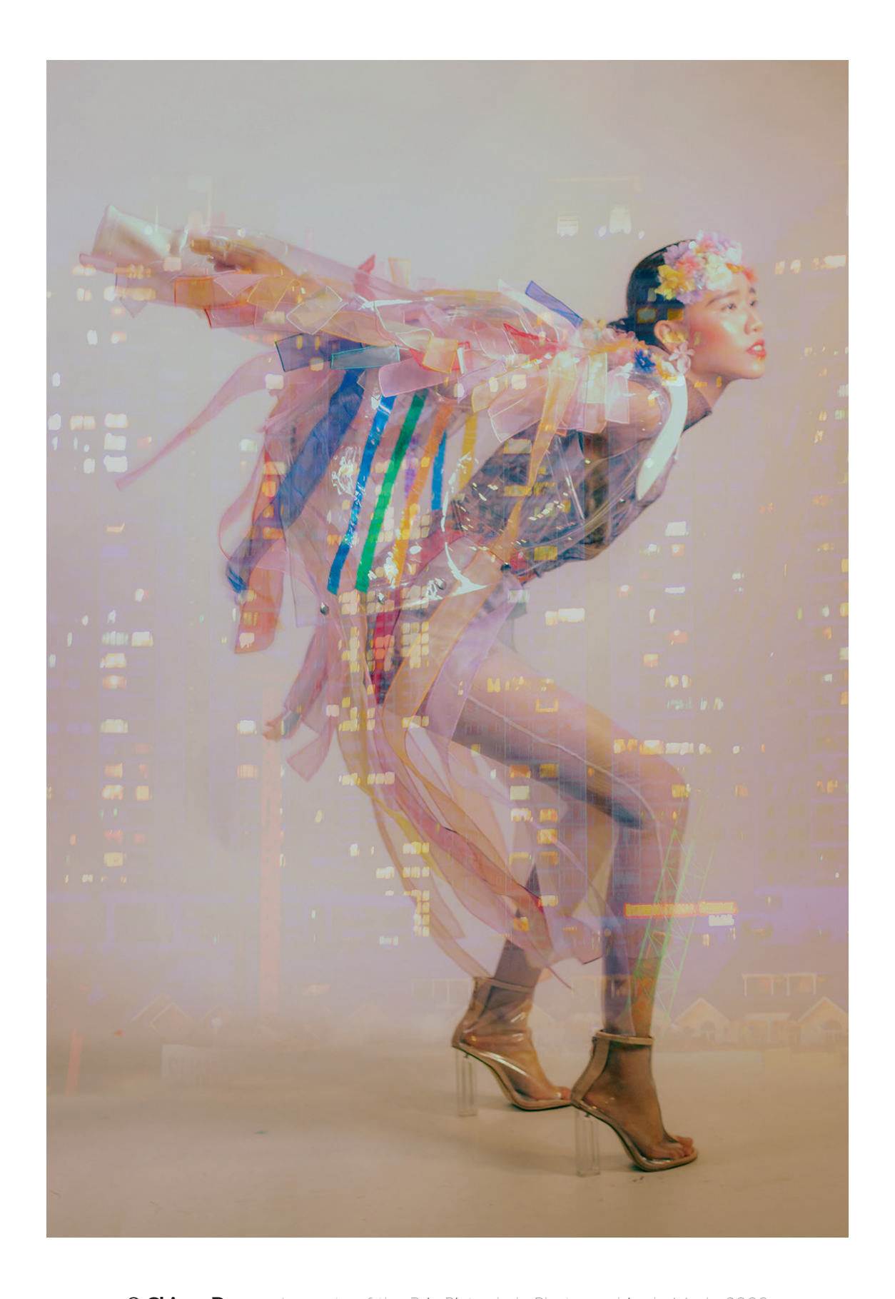
© Chiron Duong. Laureate of the Prix Picto de la Photographie de Mode 2020