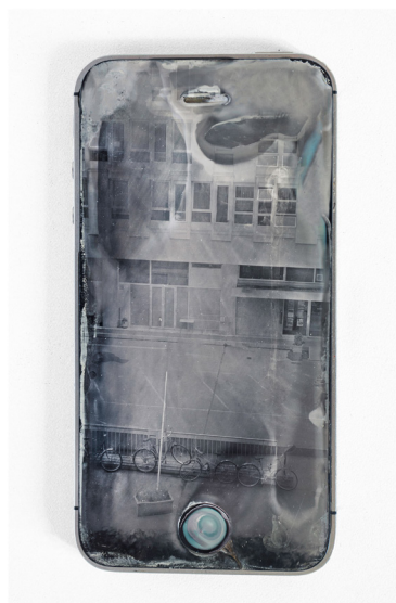
Implosion K Rochester (2022) - UV print, smartphones (iPhone 5) - Digitally simulated work on the left / Test with collodion technique on iPhone 4 on the right