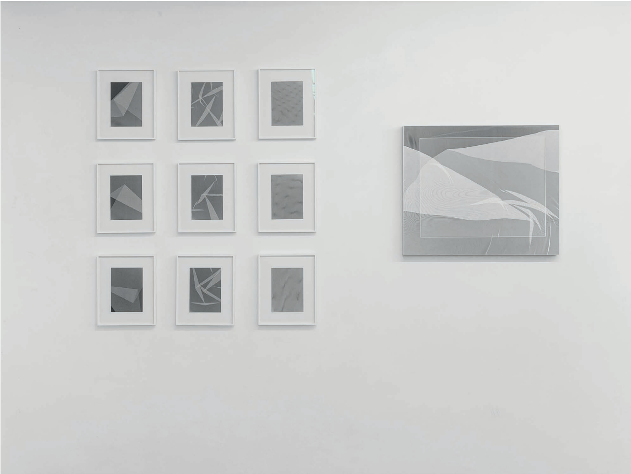
Sandrine Marc, Plis - a ppr oc he salon

Sandrine Marc uses photography as a tool for investigation and experimentation. She picks up «fragments of reality» by focusing on tenuous situations and ephemeral arrangements. The artist builds an archive of the everyday, with subjects such as architecture, plants, surface conditions and the incidence of light.