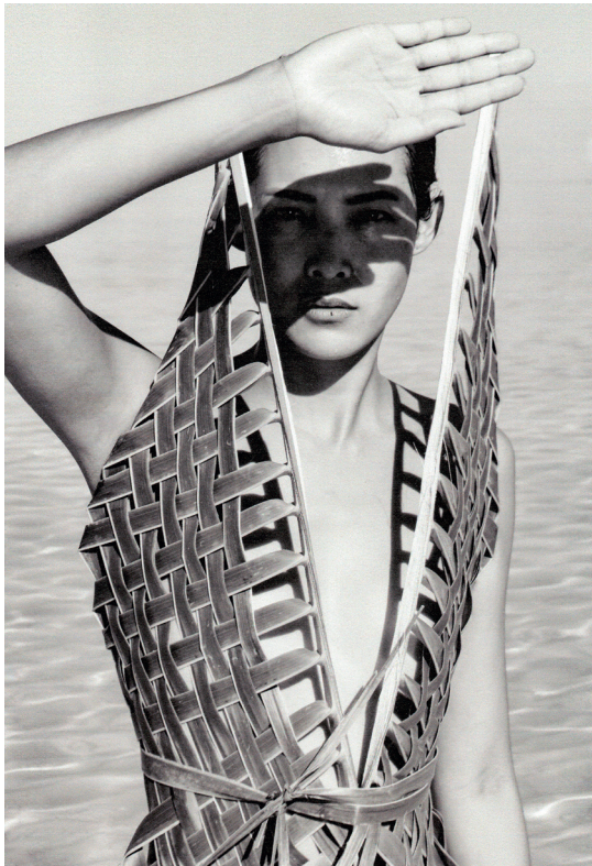
© Labō Young & Igor Furtado